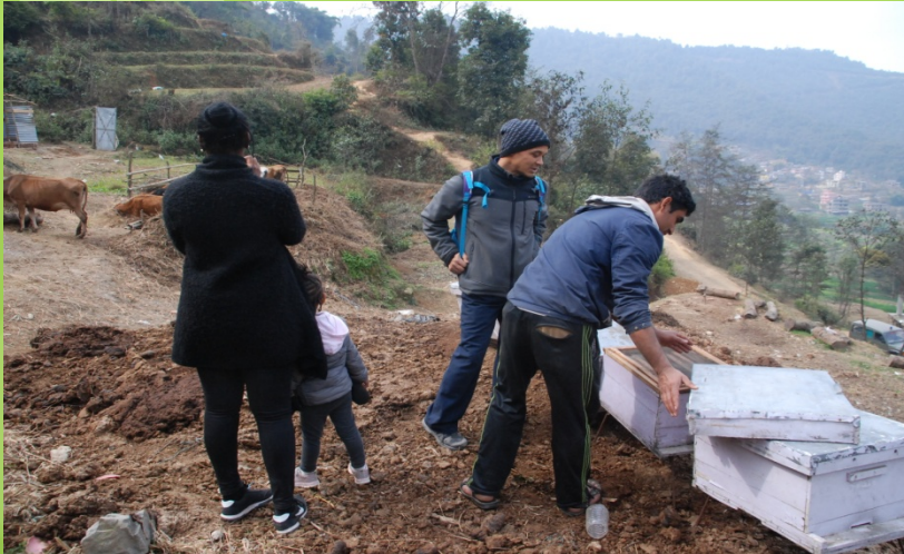
Agricultural bisnes in small village