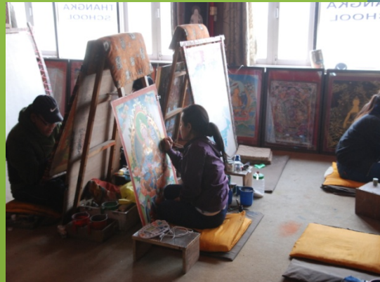
Holly Goods/Mandala Painters in Katmandu