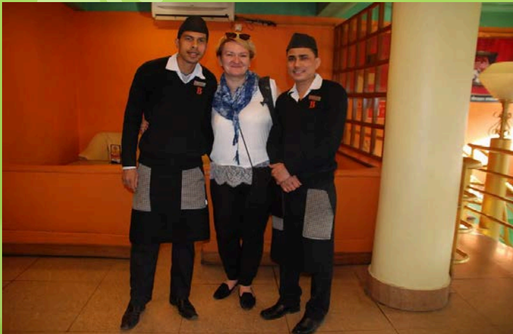
DEAF Waiters in Katmandu